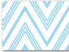
Chevron ZC0 - Aqua Flock