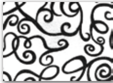
Midnight Swirl Z63 - White