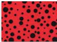
Random Dots Z42 - Red*