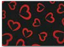
Princess Heart Z25 - Red Glitter Flock