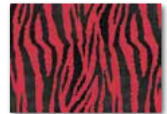
Zebra Z82 - Shocking Pink