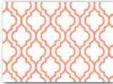
Moroccan ZM1 - Tangerine Flock