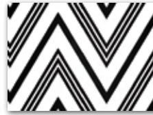
Chevron ZC2 - Black Flock