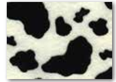
Cowpoke Z32 - Black Flock