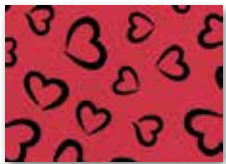
Princess Heart Z21 - Shocking Pink