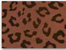
Cheetah ZBC - Brown Flock