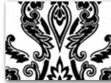
Legacy ZL4 - Black Flock