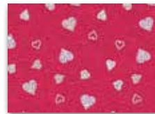
Twinkle Heart Z74 - Shocking Pink