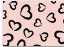
Princess Heart Z24 - Baby Pink