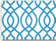
Geometric ZJ1 - Teal Flock/White