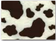
Cowpoke Z31 - Brown Flock