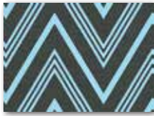
Chevron ZC1 - Aqua Flock