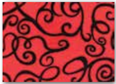
Midnight Swirl Z62 - Red*