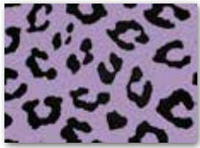
Cheetah ZBD - Black Flock