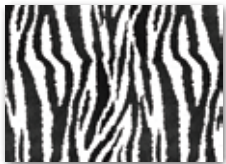
Zebra Z81 - White