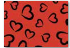
Princess Heart Z23 - Red*