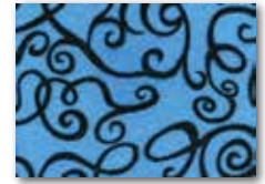
Midnight Swirl Z61 - Peacock