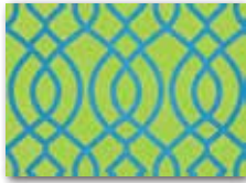
Geometric ZJ8 - Teal Flock/Neon Green