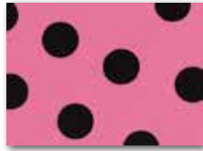
Large Dot Z92 - Candy Pink