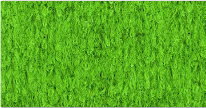
J4X Groovy Green