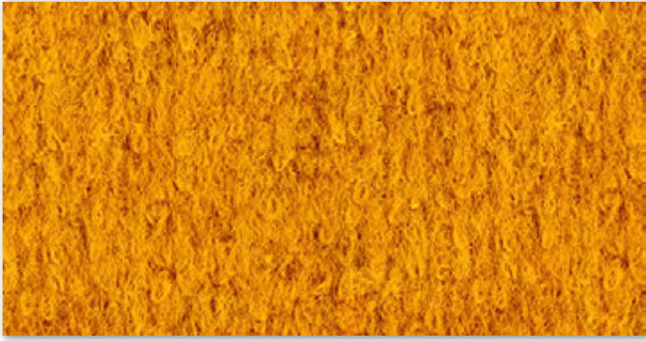
J2X Marmalade Sky