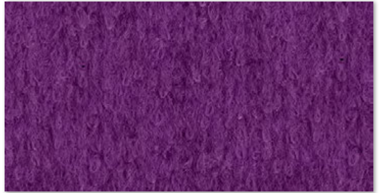
J7X Purple Passion