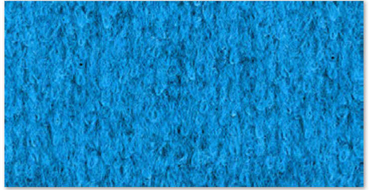
J6X Moody Blue